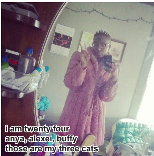
I am twenty four anya, alexei, buffy those are my three cats