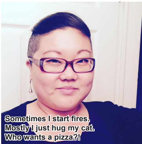
Sometimes I start fires. Mostly I just hug my cat. Who wants a pizza?!