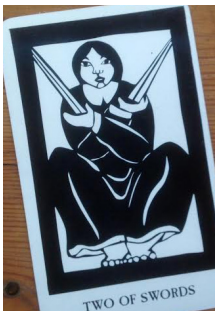
Two of Swords (From Thea's Tarot)

What's with the blockade? Are you feeling threatened? Or just need a little peace and quiet to think? Sometimes you just have to take a little time out to focus on what's happening inside your head and shut out the noise - but beware the walls you're building don't shut out those who would help and support you.