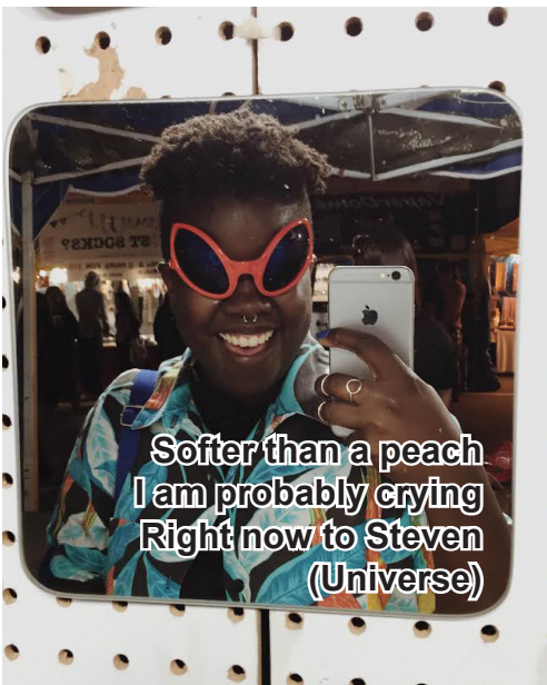
Softer than a peach I am probably crying Right now to Steven (Universe)