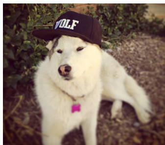
20 likes mkelly #autostraddecamp #wolf