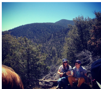
tallandvegan Queers + mountains + Taylor Swift = 🍷🍷🍷 #autostraddlecamp